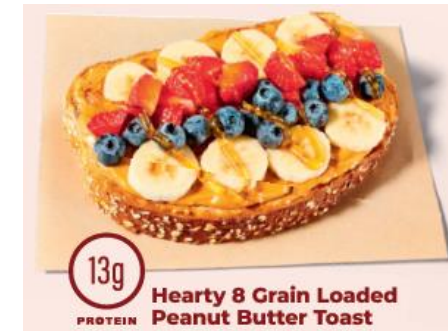
Hearty 8 Grain Loaded Peanut Butter Toast

Allergens: Tree Nuts (Hazelnuts, Coconut), Wheat