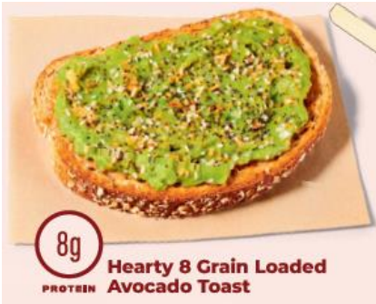
Hearty 8 Grain Loaded Avocado Toast