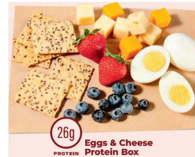
Eggs & Cheese Protein Box